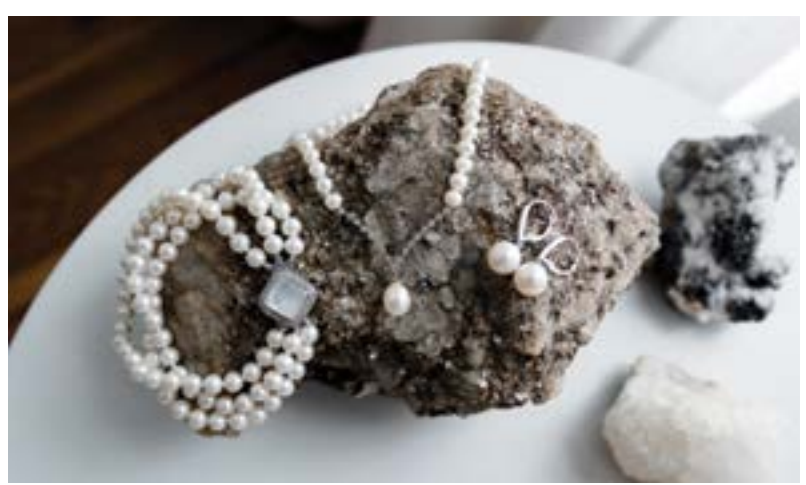
Visit BridalBlissMagazine.com for more blissful details!